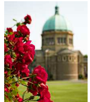
Haileybury School, UK