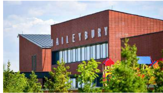
Haileybury Astana School