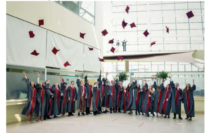
Graduation at Haileybury Kazakhstan